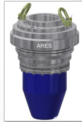
Ares Bearing Assembly