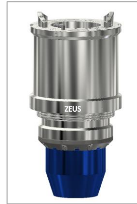
Zeus Bearing Assembly